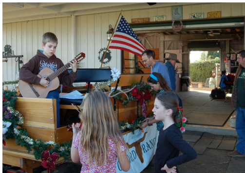
November 29, 2008 - Parade Practice & decorating day for the 2008 Lodi Parade of Lights. What a fun day!