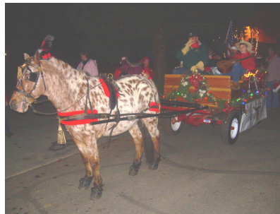
Waiting for the parade to start