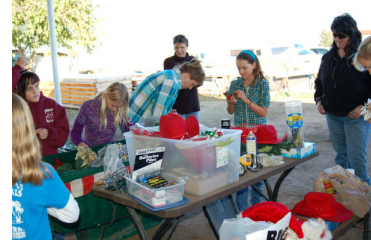
November 29th - Oh what fun it is to decorate the wagon and cart! Best of all was the wagon rides & cookies!