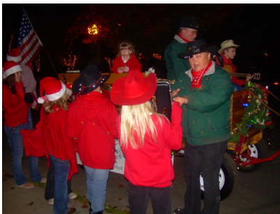
Lots of excitement while getting ready to start the parade