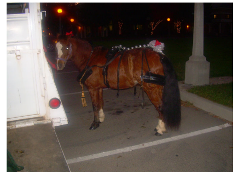
Rosey waiting to get hitched