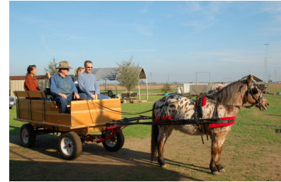
December 4, 2008 - The Lodi Christmas Parade of Lights The Doves Guidance Program - Won 2nd place!